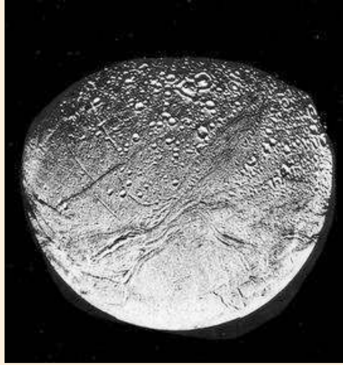
A view of a moon of Saturn.

Take this quiz on the natural satellites in the solar system