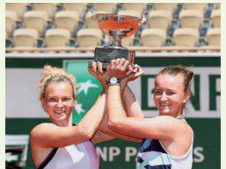
Katerina Siniakova and Barbora Krejcikova pose with the trophy after winning the women's doubles final.

Answer: Barbora Krejcikova became the first player since Mary Pierce in 2000 to win the singles and doubles titles at the French Open on Sunday.