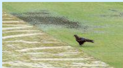
Blagya Prakash K

Answers: 1. Weal, 2. Bore, 3. In, 4. Wet, 5. Nob.