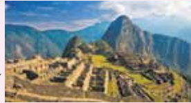
Answer: Machu Picchu

Read the clues and guess the heritage site.